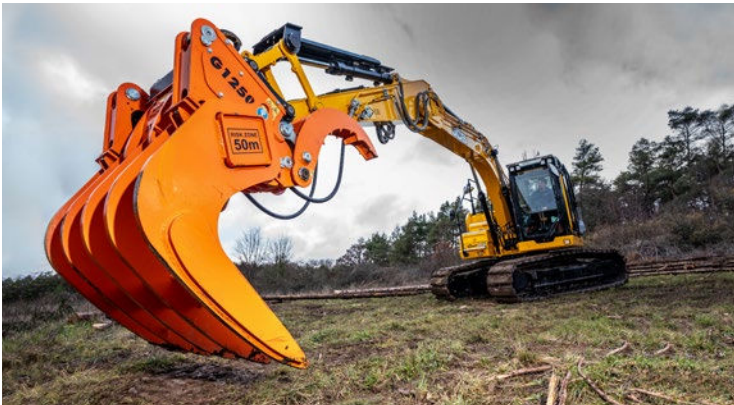
Mountable to all common carrier vehicles.