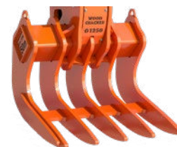
Woodcracker® G without gripper fingers