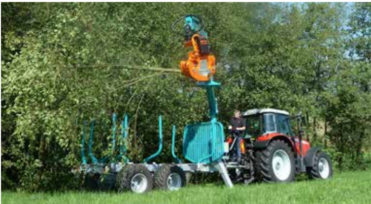
Fast harvest of small trees and bushes.