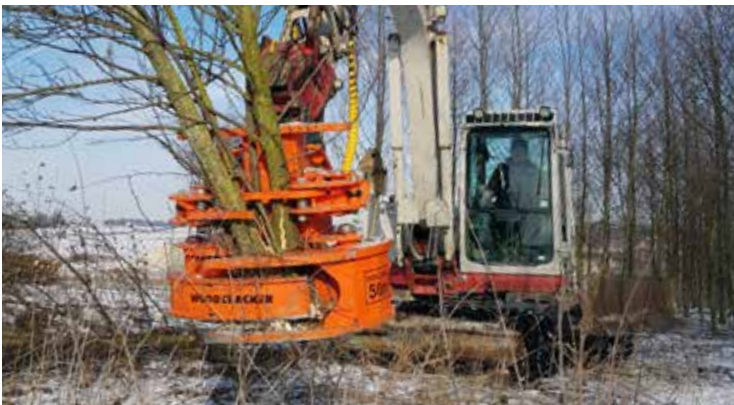
Optional with accumulator.