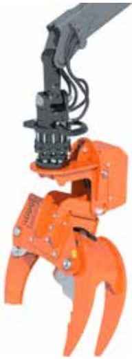
Autotilt-funktion at the Woodcracker® CB150 crane