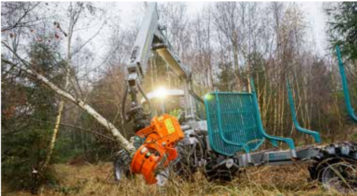
ideal for weak material.