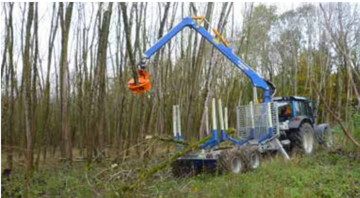
CB150 crane suitable for forest crane attachment.