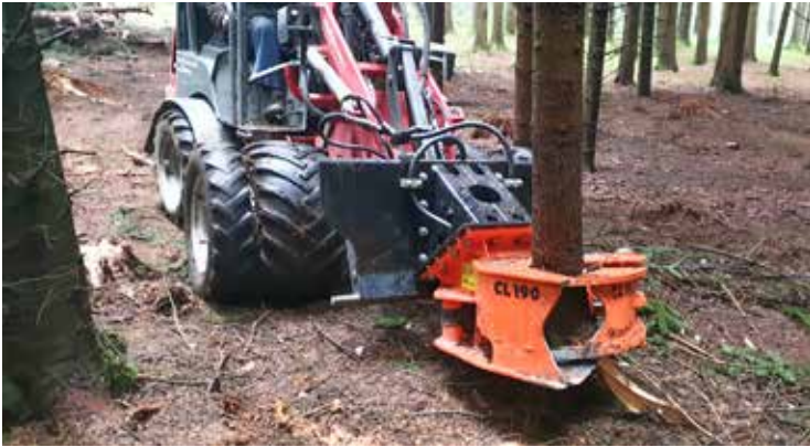
Woodcracker® CL190 cuts weak wood up to 25 cm.