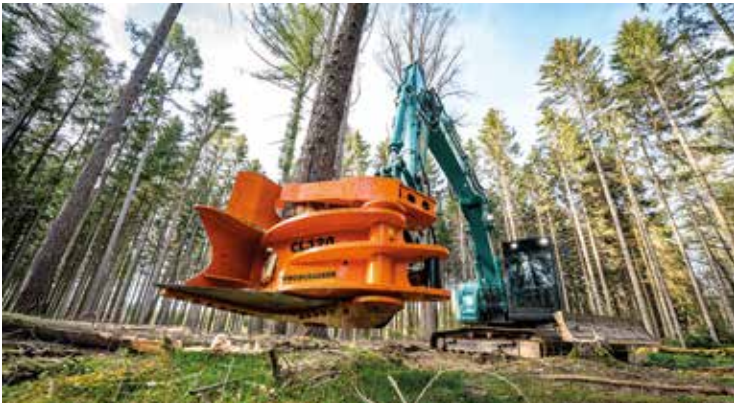
Fast harvest of small trees and bushes.