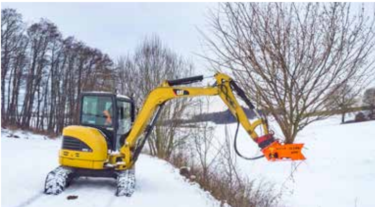
For mini excavators from 2,5t.