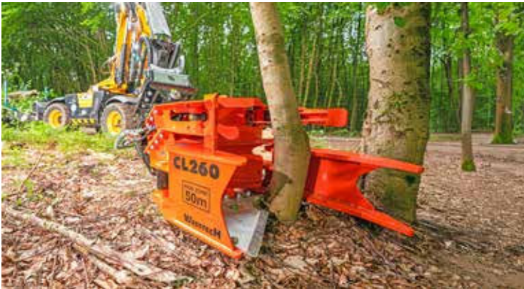
Optional available with accumulator.