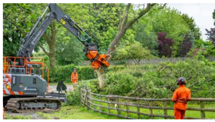
Maintenance work along traffic roads.