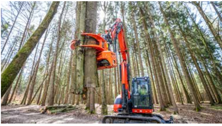
Sophisticated, strong gripper.