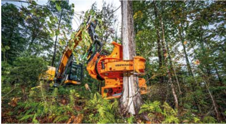
Rapid chopping and piling.