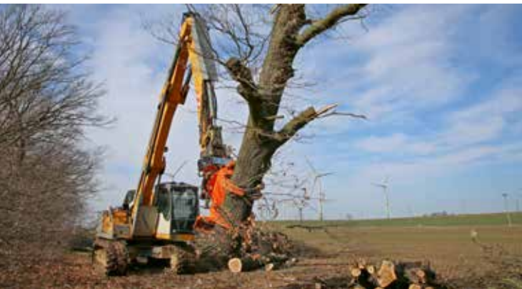
Maintenance work along traffic roads and routes.