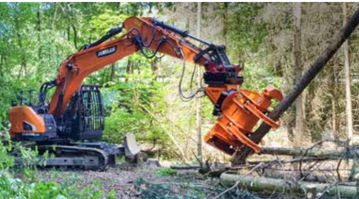
Harvest of tree trunks.