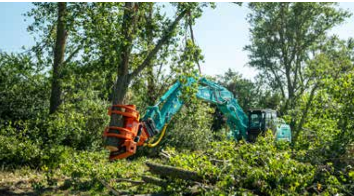
The strong grippers hold the tree firmly.