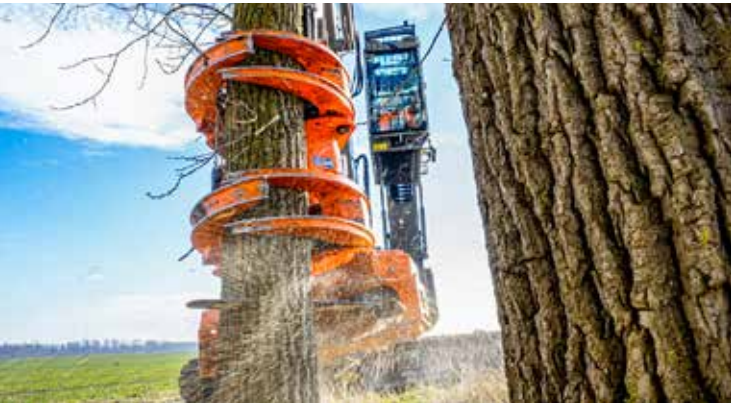
Two strong independet grippers.