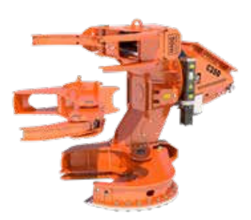
optional: Accumulator (QC)