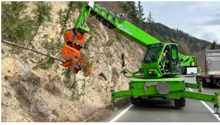
C250 on the Roto-telehandler.