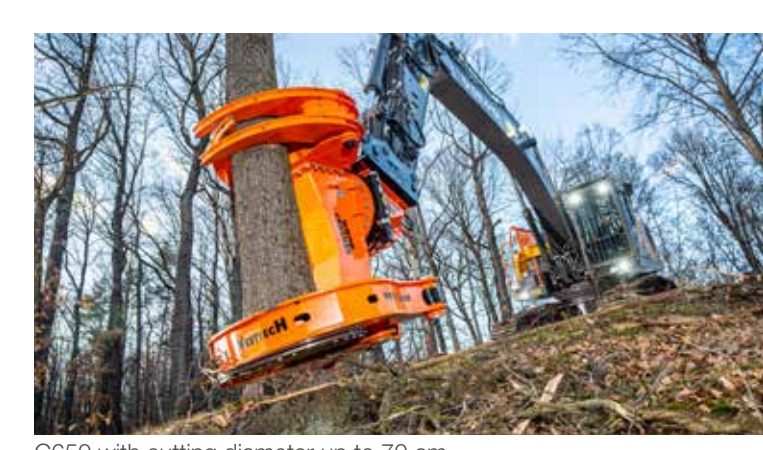
C650 with cutting diameter up to 70 cm.