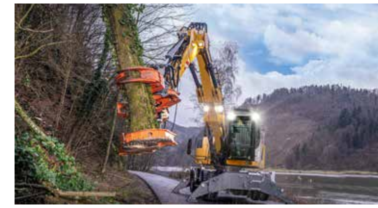
C350 during forest edge maintenance.