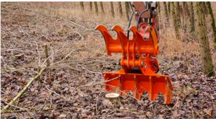
GR840 during rootstock harvesting.