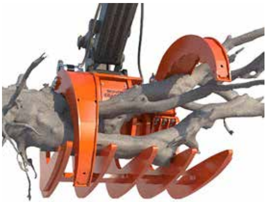
Individual adjustment of the gripper fingers to the harvested material.