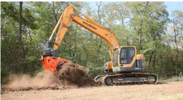
Clearing and caring of large areas.