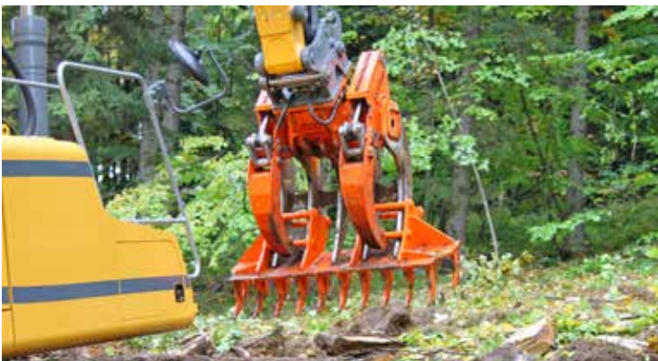
Woodcracker® G1250 with fine rake.