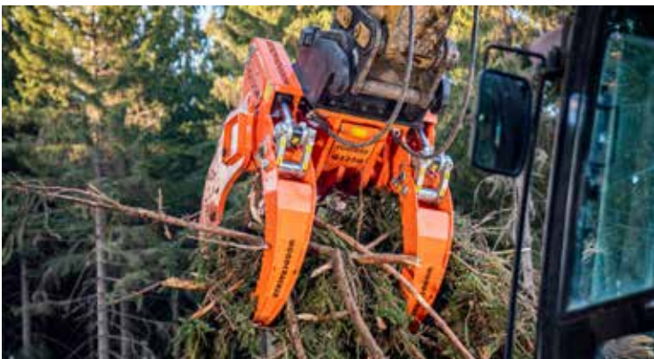
Very large capacity.